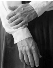
GRANDMOTHER OF CHILDREN OF A PERSON CONVICTED OF A SEX OFFENSE

“Yet one more tragedy is that his kids are going to have to suffer for his actions with community notification following them everywhere he goes. They are going to unfairly bear the brunt.”